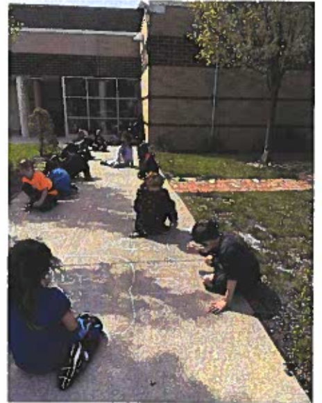
- Kids enjoying the weather while doing word work!

Balanced classes are being created now & will be posted the evening before school starts.